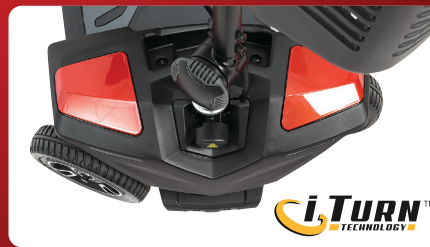
Patent-pending, intelligent-turning, iTurn Technology™

Get the 4-wheel scooter with a 3-wheel turning radius with the Zero Turn 8 and Pride's patent-pending, intelligent-turning, iTurn Technology™. Navigate tight corners and small spaces effortlessly with a 38.25" turning radius. Illuminate your ride with bright LED lighting. Dual motors and CTS suspension ensure a smooth and comfortable drive.