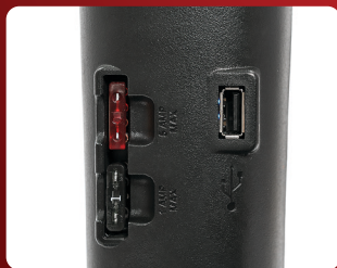
USB charger built into tiller