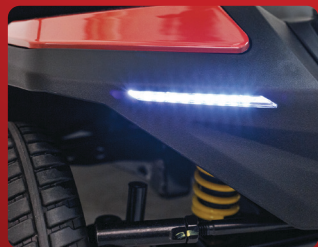
Front LED lights